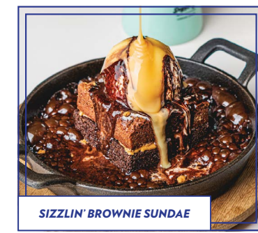
SIZZLIN' BROWNIE SUNDAE

Garden salad with chicken breast, bacon, hard-boiled egg, tomato, cucumber, red onion, and cheese blend, served with your choice of dressing.