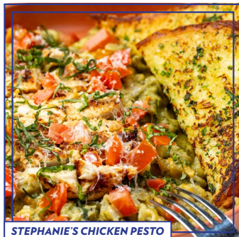
STEPHANIE'S CHICKEN PESTO