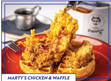
MARTY'S CHICKEN & WAFFLE

JABRA'S STEAK & EGGS* 34 🌿🐔🥚 A staff favorite! Perfectly cooked flavorful steak served with two eggs any style, breakfast potatoes and your choice of toast. Available GF