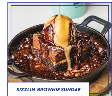
SIZZLIN' BROWNIE SUNDAE

CHEF TONY'S COBB SALAD 18 🌿🐔 Garden salad with chicken breast, bacon, hard-boiled egg, tomato, cucumber, red onion, and cheese blend, served with your choice of dressing.