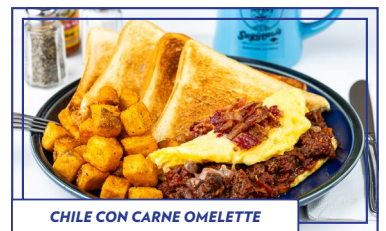
CHILE CON CARNE OMELETTE

ZOEY'S MUSHROOM SPIN 19 🌿🐔🥚 A three egg omelette with sautéed mushrooms, house-made pesto, and topped with Swiss cheese. Served with breakfast potatoes and choice of toast.