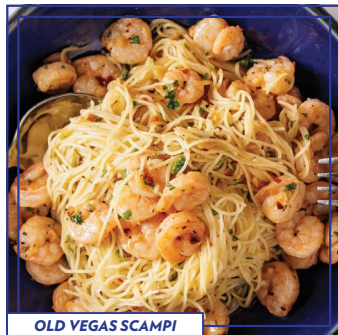
OLD VEGAS SCAMPI