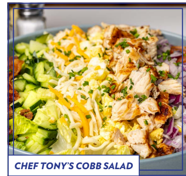
CHEF TONY'S COBB SALAD