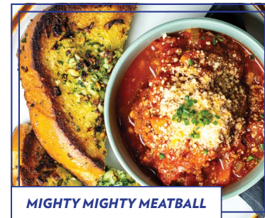
MIGHTY MIGHTY MEATBALL

BUFFALO CHICKEN TENDERS 15 🌿🐔🥚 Chicken tenders in house made buffalo sauce, served with blue cheese dressing, celery and carrots.