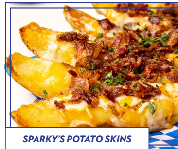
SPARKY'S POTATO SKINS