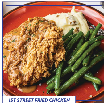
1ST STREET FRIED CHICKEN