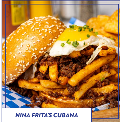
NINA FRITA'S CUBANA