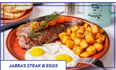
JABRA'S STEAK & EGGS