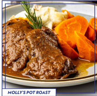
MOLLY'S POT ROAST

Elevate your experience by adding brisket, shrimp, fried chicken (extra charge)