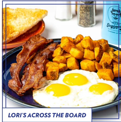
LORI'S ACROSS THE BOARD

NINA FRITA'S CUBANA* 18 🌿🥚 "THE WORLD'S BEST HANGOVER SANDWICH" A traditional cuban sandwich with chorizo, fries, harissa aioli, and topped with a sunny side up egg. Served on a sesame brioche bun.