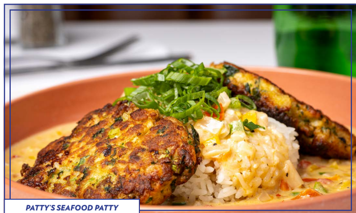
PATTY'S SEAFOOD PATTIE