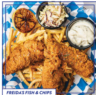
FREIDA'S FISH & CHIPS