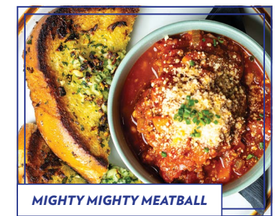
MIGHTY MIGHTY MEATBALL

Chicken tenders in house made buffalo sauce, served with blue cheese dressing, celery and carrots.