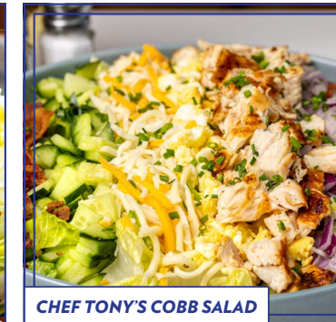
CHEF TONY'S COBB SALAD