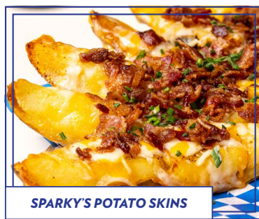
SPARKY'S POTATO SKINS